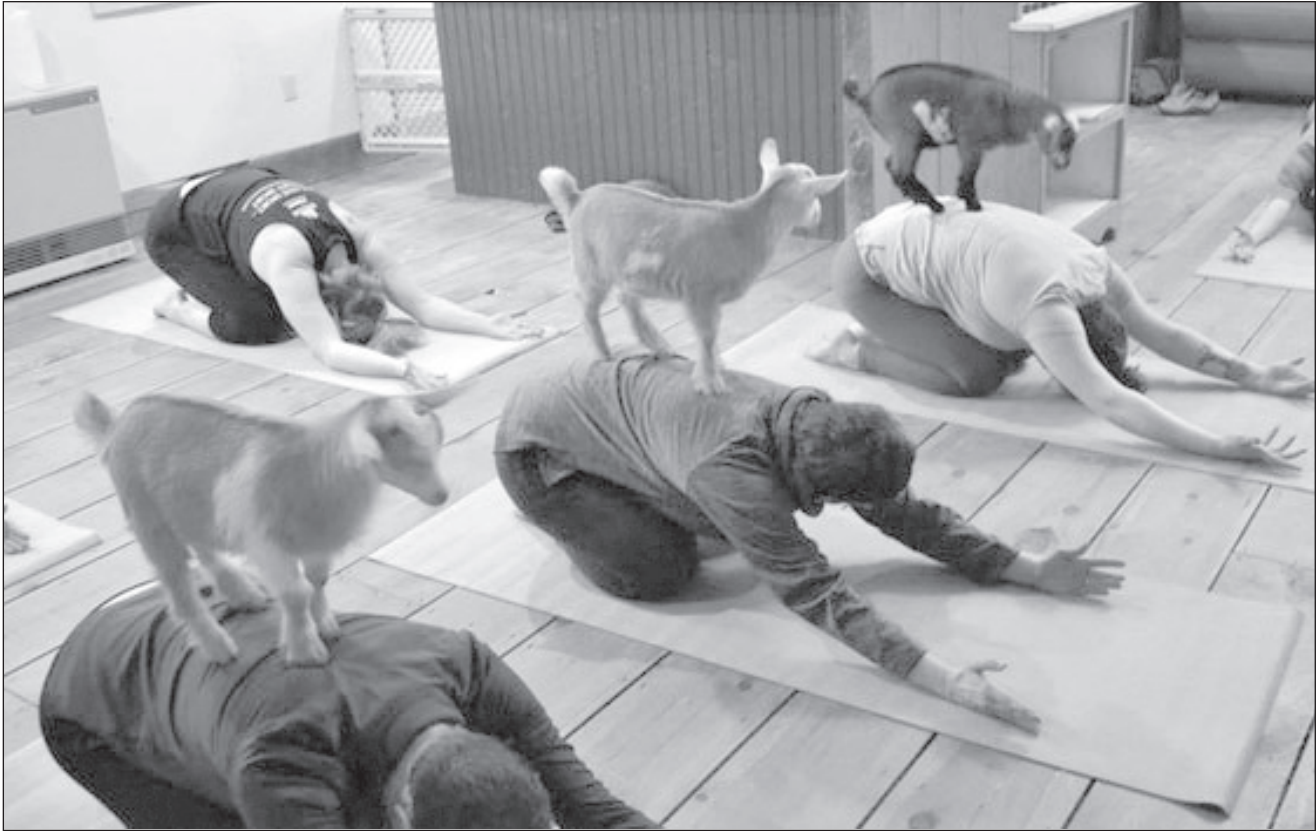
Goat yoga is the latest workout in Stone Lake. Held at Luxe Fiber Designs Mill, the yoga workout is made more entertaining with goats roaming the room.